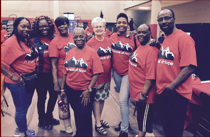
Summit of Hope Resource Providers

The goal of the Summit of Hope events is public safety through reduced recidivism. The events provide community expos of services and support to encourage and supply those reentering into society with the tools needed to become crime-free responsible members of society. The Summit of Hope is an invitation only event for those local parolees in each community. The event is designed to bring the community together, gather all the resources available, and put them under one roof in providing a one-stop environment where parolees can obtain the necessary assistance to move past the barriers which prevent them from success.